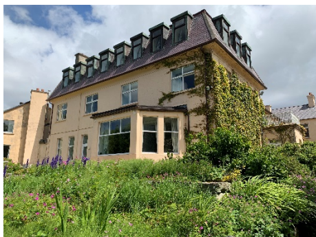
Zetland Country House Hotel – 2 Day Stay