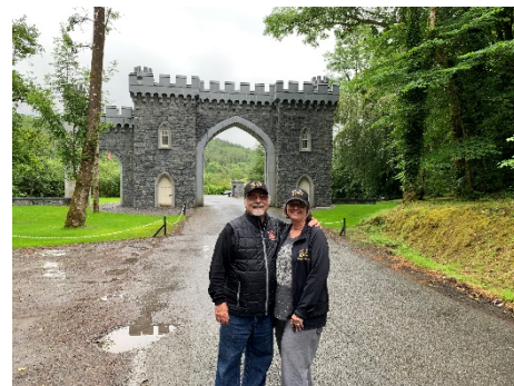
Lough Rynn Castle – 2 Day Stay